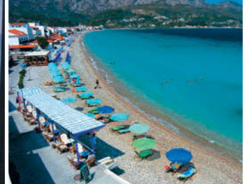
Kokkari main beach as viewed from Lemos Hotel