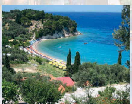
adou beach near Kokkari

A good bus service links Kokkari with Samos Town and Karlovassi. All excursions pick-up from the village, mountain bikes can be rented, there is a windsurf school, and the mountains behind offer fine walking opportunities.